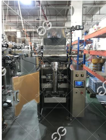
Powder Filling Machine

Packing Range: 50-1,200g Making form: back seal Packing Speed: 25-35bags/min Power: 220v,50HZ,2.5KW Weight: 300kg Machine dimension: 1100×970×1980mm Bag size: Film Width: 300-450mm Bag Length: 100—270mm