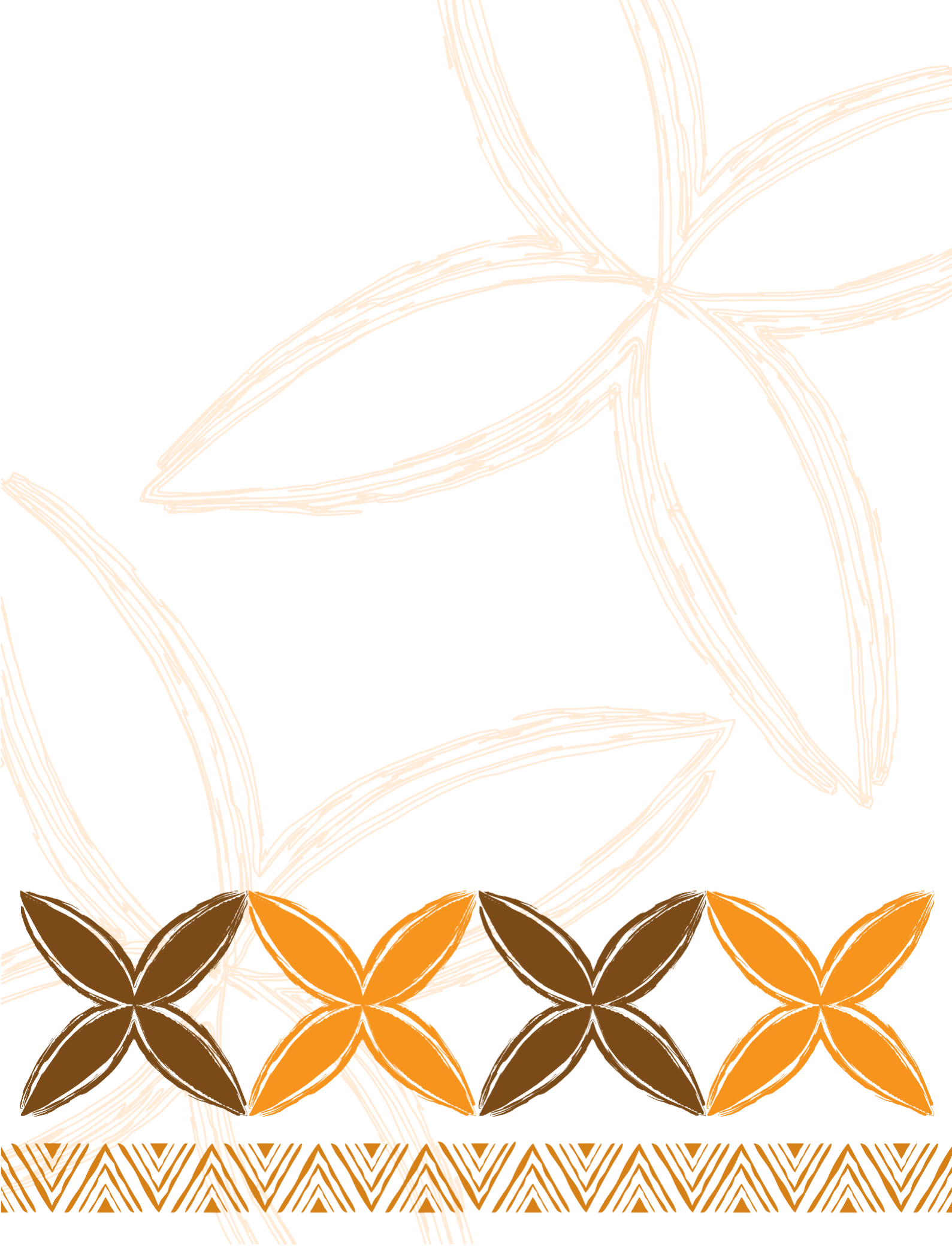
Page 31 of 31